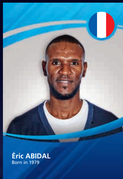
Éric ABIDAL Born in 1979