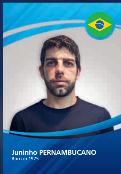
Juninho PERNAMBUCANO Born in 1975